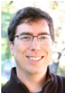
Professor Jonathan Zittrain Co-Director, Berkman Center for Internet & Society Harvard Law School